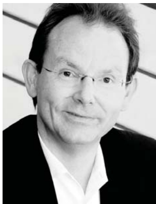
Welcome Remarks by the Chairman of “The 29th International Conference of the Polymer Processing Society”